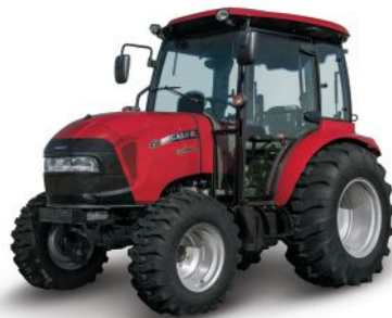
FARMALL COMPACT C 28–46.6 PTO HP