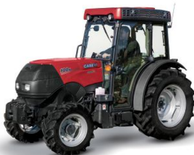
FARMALL N & V 62–93 PTO HP