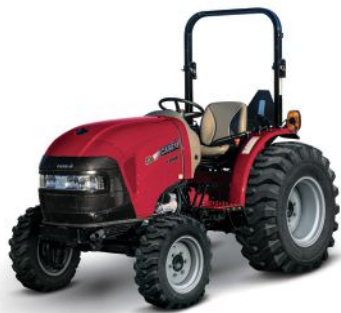
FARMALL COMPACT A 28–34 PTO HP