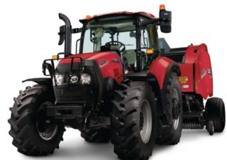
FARMALL UTILITY U 93–100 PTO HP