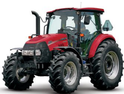
FARMALL UTILITY C 50–100 PTO HP