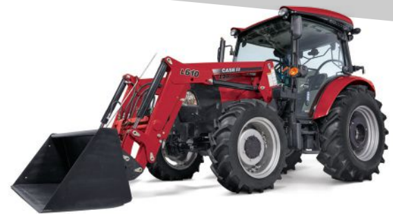
FARMALL UTILITY A 45–100 PTO HP