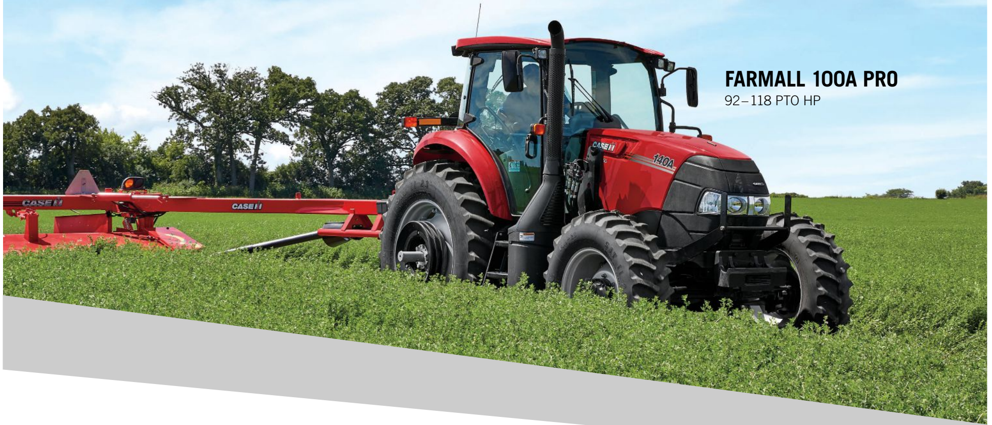
FARMALL 100A PRO 92–118 PTO HP